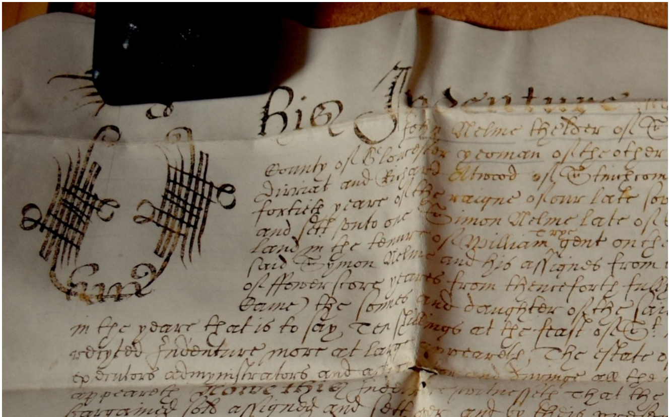
Top left corner of 1648 indenture for lease of 1 acre of parish land at Brood Mead