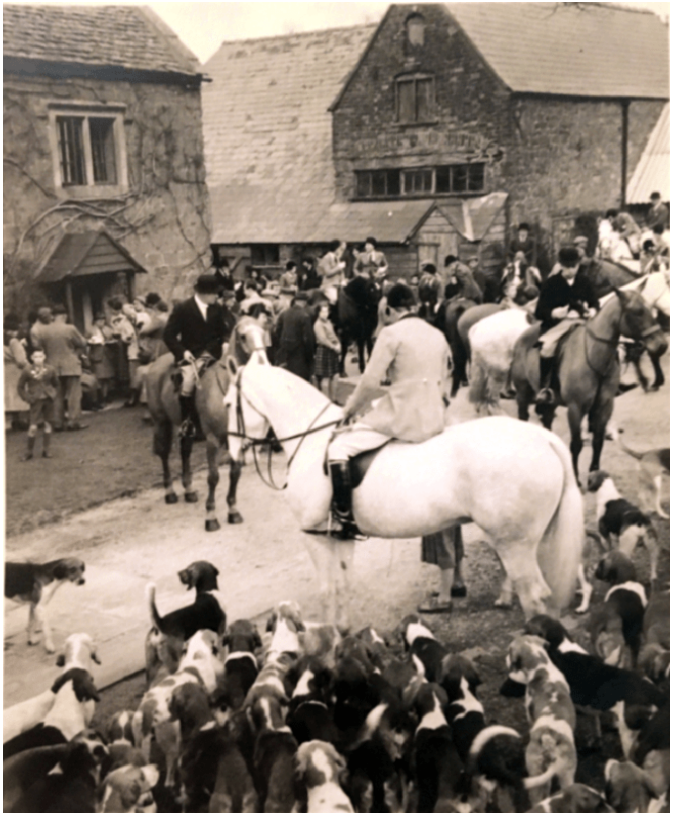
Berkeley Hunt at Combe House – March 1957